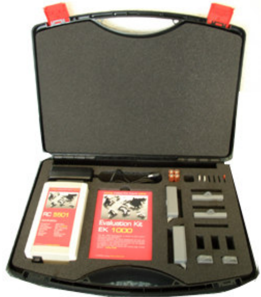
Evaluation Kit EK 1000

kit includes a variation of short and long distance “broadcast-tags” with and without sensors for mesuaring temperature or motion. For detailed information please see the product-sheets.